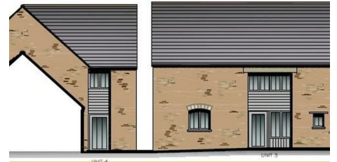
WEST ELEVATION - UNITS 3 & 4