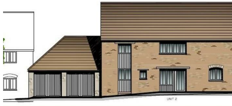
WEST ELEVATION - UNITS 1 TO 4